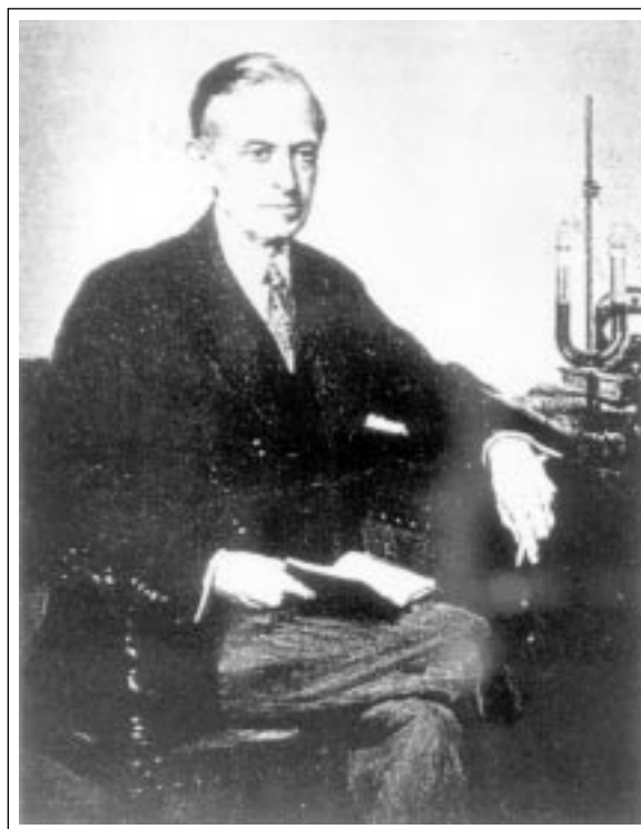
Arthur Amos Noyes

Research in the third paper, which dealt with the effect of other salts on the solubility of TlCl, was directed by Bray (12). The solubility of TlCl itself, found to be 16.07 mM per liter, was only 0.13% lower than the original value found by Noyes (5). The increased solubility caused by the presence of KNO_3 or of K_2SO_4 , salts without a common ion, was attributed to the formation by metathesis of nonionized TlNO_3 or Tl_2SO_4 . At comparable concentrations, the